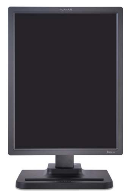
AMLCD panel mounted on desk stand